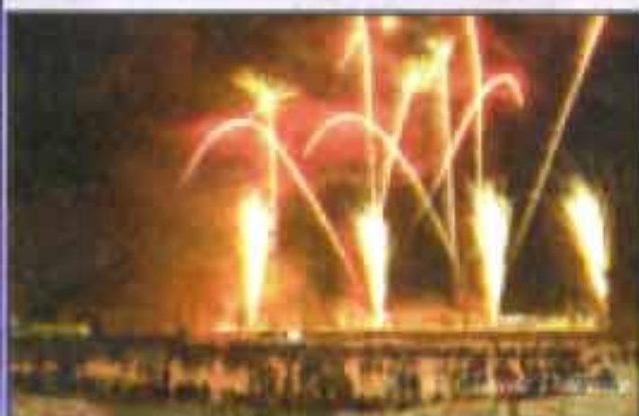
Montreal High Lights Festival (Le Festival Montréal en Lumière)

On a recent visit, I was able to enjoy both aspects of this lovely city. As an added bonus, my visit coincided with "Le Festival Montreal en Lumiere," which is an ongoing effort to light up many interesting buildings in the city with creative and colorful lighting effects. The impact of the city's efforts is stunning.