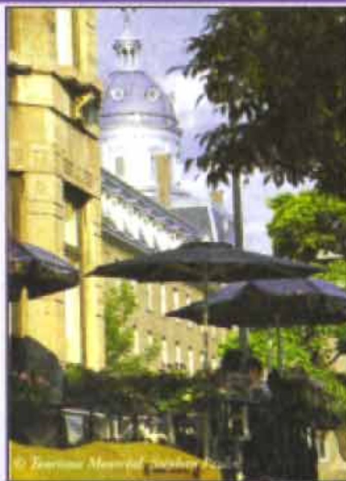
Terrace on Saint-Denis Street

On the next evening, I was treated to a truly world class dinner at one of Montreal's finest restaurants. Verses Restaurant , in the Nelligan Hotel offered a 6-course tasting menu of remarkable variety and creativity.