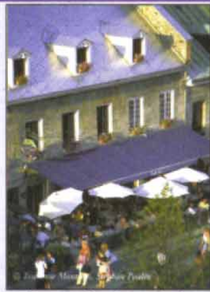
Terrace on Place Jacques-Cartier

In late June and early July, Montreal plays host to a world-renowned jazz festival. This 10-day, multi-venue music